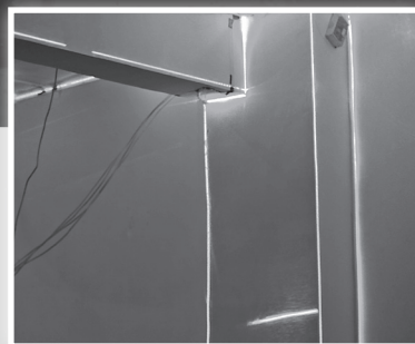
A light installation created by Peter Vink inside an art space.